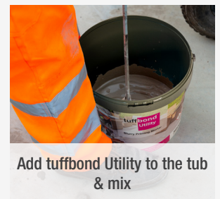
Add tuffbond Utility to the tub & mix