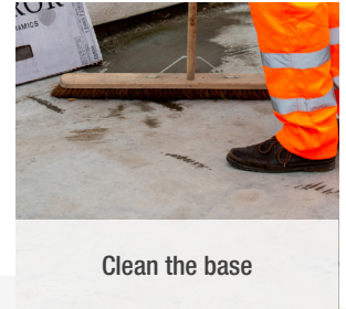
Clean the base

Do not walk on, or allow any pedestrian or vehicle movement across the newly laid area(s) until the bedding mortar has gained sufficient strength, after which jointing work can commence. This is typically not less than 12 hours.