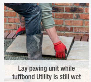
Lay paving unit while tuffbond Utility is still wet