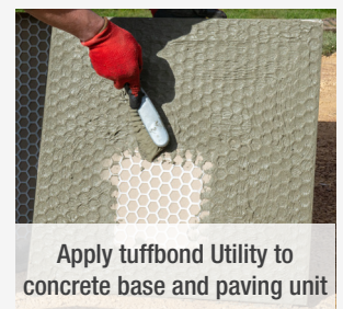
Apply tuffbond Utility to concrete base and paving unit